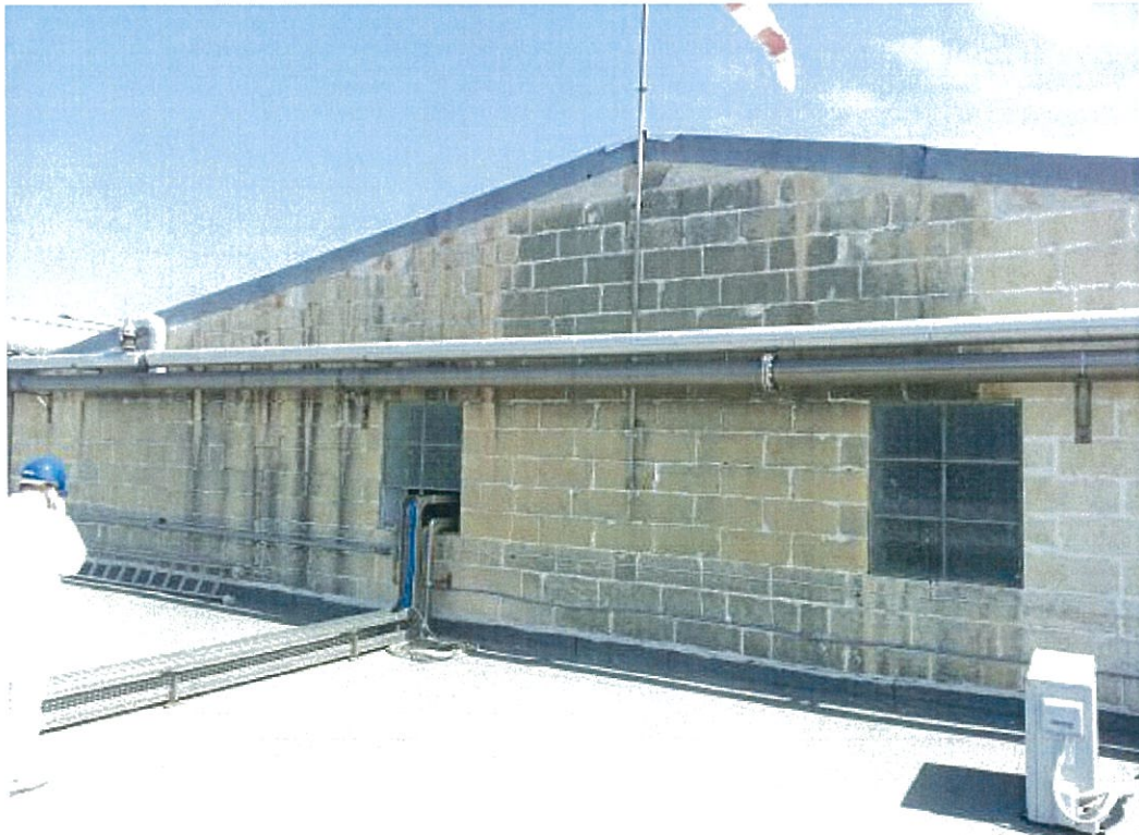
Fig. 1 : Existing location of proposed units

The proposed Air handling units shall be located at roof level over an existing office block constructed over two floors at Marsa A61 Factory, Marsa Industrial Estate. The floor of the roofing comprises a torch-welded bituminous membrane over the existing roof screed.